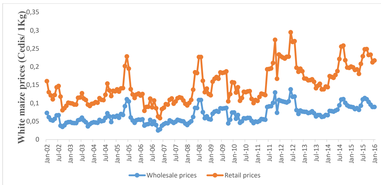
Figure 3: White maize wholesale and retail price series, from January 2002 to January 2016