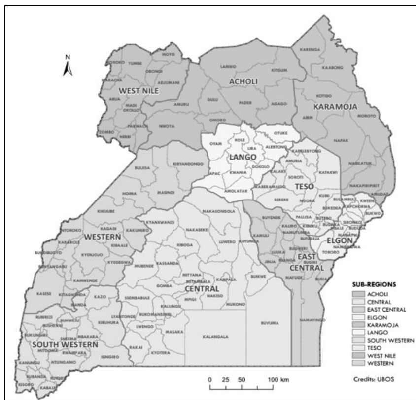
Figure 1: Map of Uganda showing the location of the study area in Acholi sub-region.

Gliricidia ( Gliricidia sepium ), Leuceana ( Leuceana leucocephala ) and Calliandra ( Calliandra calothyrsus ). The tree/shrub seedlings used for these trials were established two months earlier in nursery beds near the demonstration sites. Blocks containing rip lines and permanent planting basins were maintained by means of herbicide spraying. Blocks containing the control plots and alley cropping were managed through regular hand hoeing. Generally, the evaluation sites were established on fairly flat terrain, devoid of anthills, at least 500 m from major roads, and were not adjacent to any forests or dump sites. The test crop that was used in this trial was maize (Longe 5 variety), planted in September 2018 (second planting season) and May 2019 (first planting season).